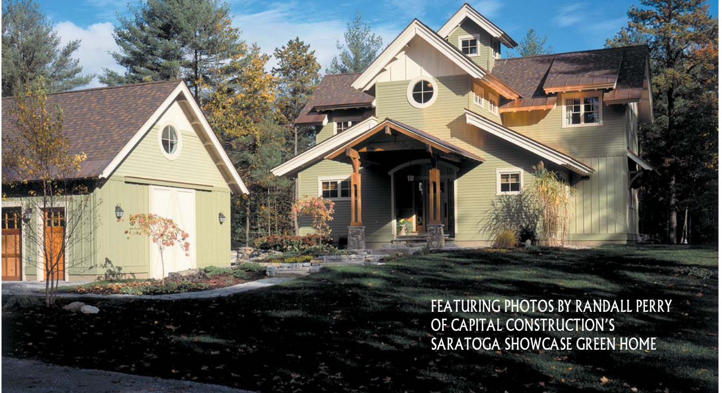
FEATURING PHOTOS BY RANDALL PERRY OF CAPITAL CONSTRUCTION'S SARATOGA SHOWCASE GREEN HOME

Not just for the eccentric, green is becoming a thoughtful way to build even high-end homes